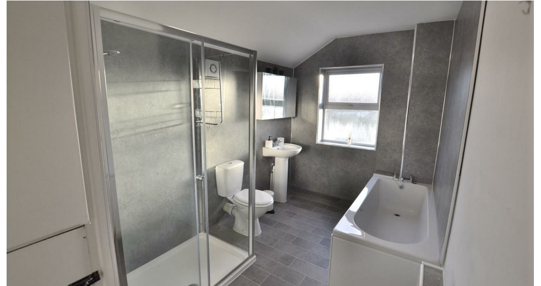
'Ashleigh Villas', 4 Warner Street, Barrow Upon Soar, Leicestershire, LE12 8PB