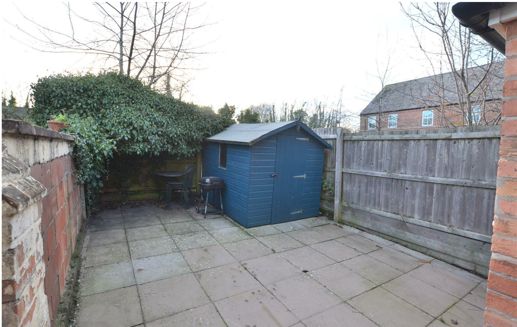
'Ashleigh Villas', 4 Warner Street, Barrow Upon Soar, Leicestershire, LE12 8PB