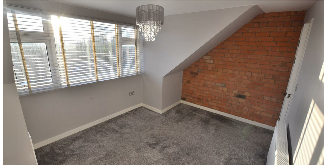
'Ashleigh Villas', 4 Warner Street, Barrow Upon Soar, Leicestershire, LE12 8PB