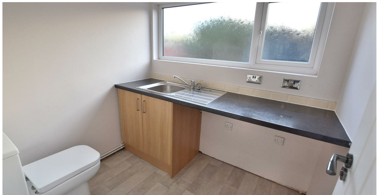
'Ashleigh Villas', 4 Warner Street, Barrow Upon Soar, Leicestershire, LE12 8PB