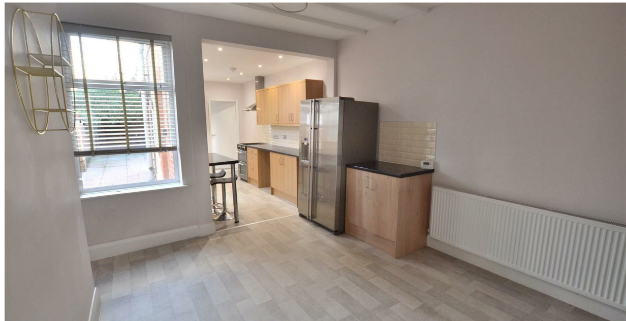
'Ashleigh Villas', 4 Warner Street, Barrow Upon Soar, Leicestershire, LE12 8PB